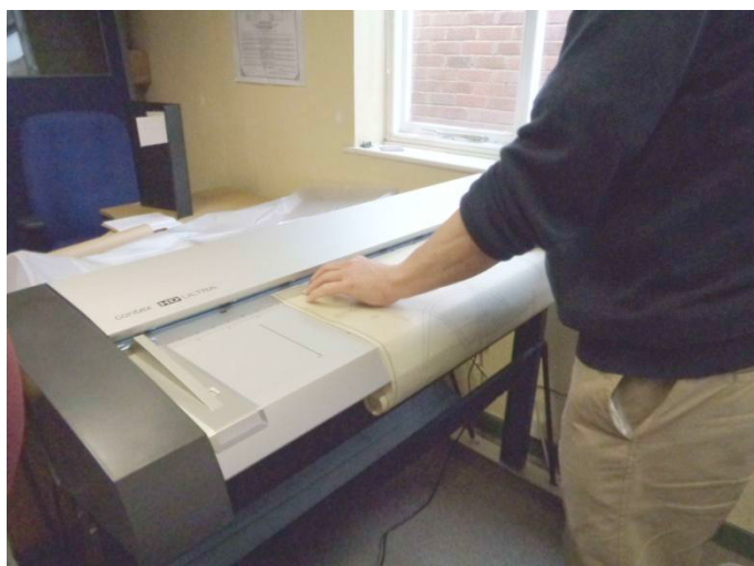
Contex 42 inch HD Ultra Wide Format Scanner.

Our scanning facilities are second to none, being to the same professional standard as found at the National Archives, British Museum and British Library. We currently have two scanners in operation. The first, a Contex 42 inch HD Ultra Wide Format Scanner, is designed to handle maps or large single sheet documents such as posters of any length and can scan up to 1200 dpi.