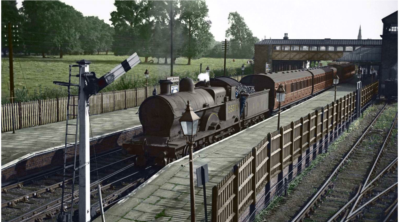
Ex-LNWR 4-4-0 Precursor Class No 225319 'Bucephalus' stands at Kenilworth's down platform in 1938