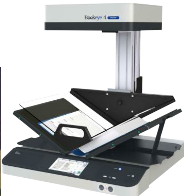
Bookeye 4 V2 Professional Archive Scanner

Our second scanner is a Bookeye 4 V2 Professional Archive Scanner which is capable of scanning case-bound documents measuring 24.4 inches by 18 inches in size. It is ideal for projects that require high quality and offers maximum productivity, an important consideration for voluntary groups whose members' time is scarce. As a special add-on to the scanner, there is also a horizontally movable V-glass plate, with which the scan template can be positioned exactly in the book fold.